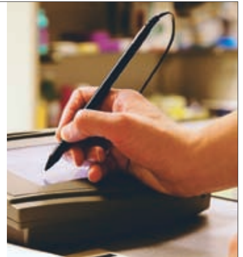
Carpal tunnel syndrome can make even simple tasks painful.

While shoulder replacement patients generally spend fewer days in the hospital than those with hip or knee replacements, they enjoy the same