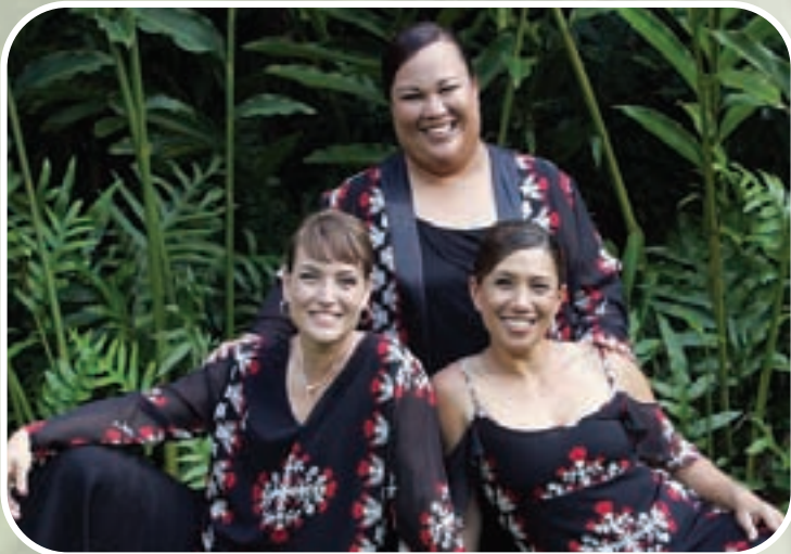
Na Leo Pilimehana