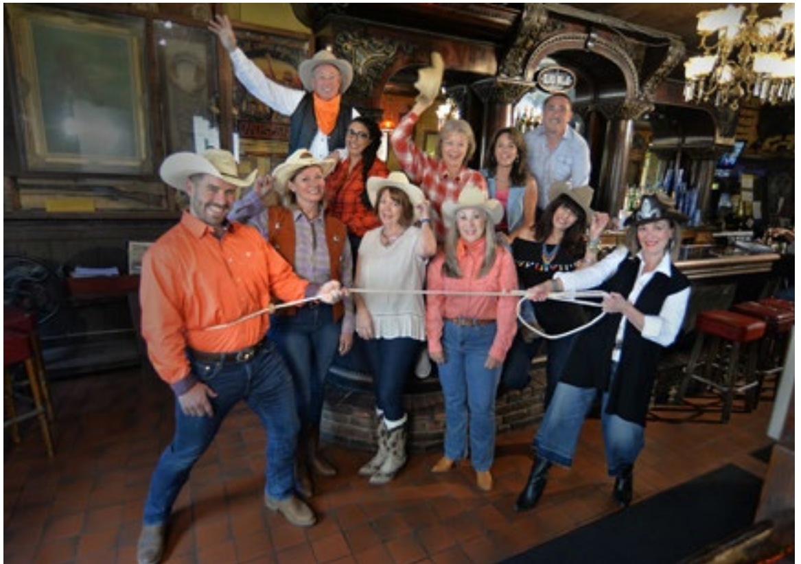
Right: The 27th Annual Fairway to Health Committee