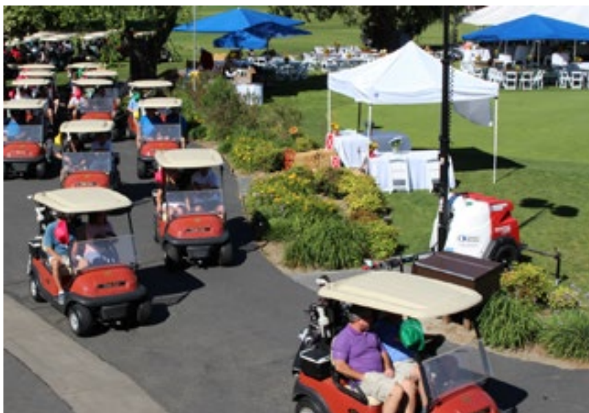
Below: And they're off!